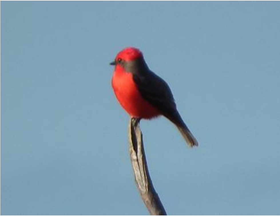
Vermillion Flycatcher (RBMcNab)