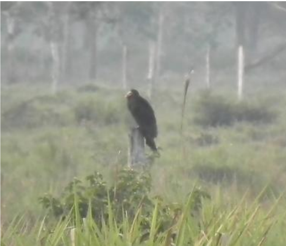
Lesser Yellow-headed (Savanna) Vulture (RBMcNab)