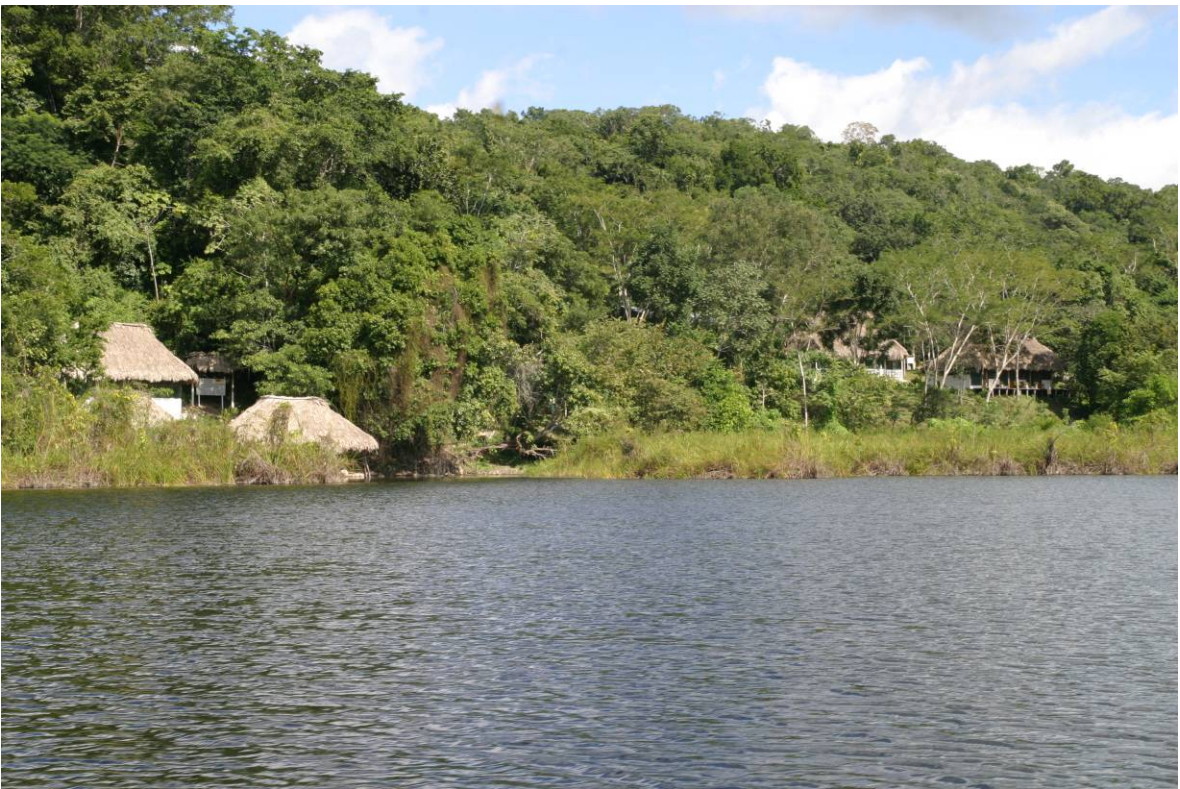
Las Guacamayas Biological Station, Laguna del Tigre National Park