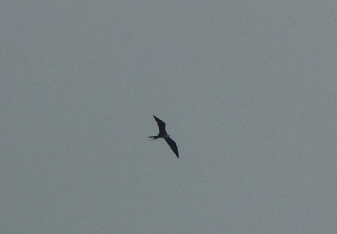
Magnificent Frigatebird (RBMcNab)